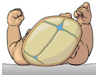
An abnormal and asymmetrical skull

The skull of a baby is very soft and malleable. If the baby usually sleeps with its head turned to the same side, the skull will become more flat on that side and other head bones will be deformed as well. Deformed head bones often will have a negative impact on neck movements.